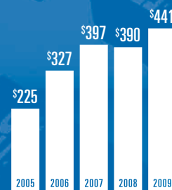
STOCKHOLDERS' EQUITY in millions