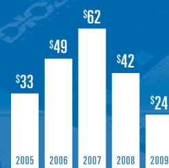
NET INCOME NON-GAAP ADJUSTED 1 in millions